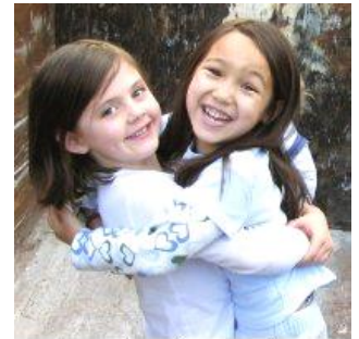
Remember when your best friend lived right next door?