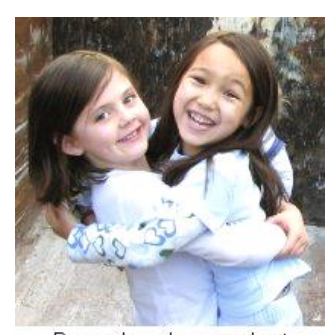
Remember when your best friend lived right next door?