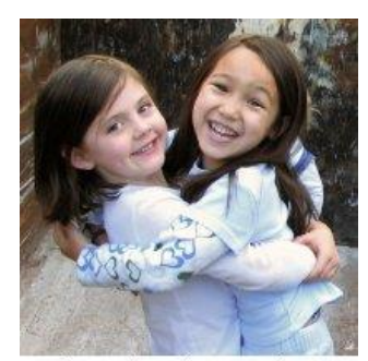
Remember when your best friend lived right next door?