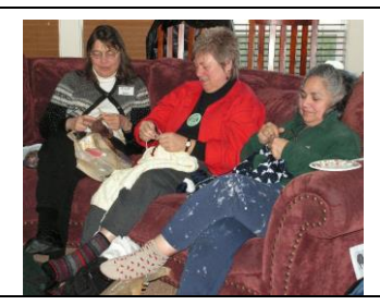
Sharing a passion (Talented CoHoots dazzle neighbors with their synchronized flashing needles)