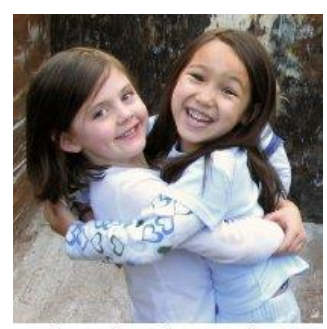
Remember when your best friend lived right next door?