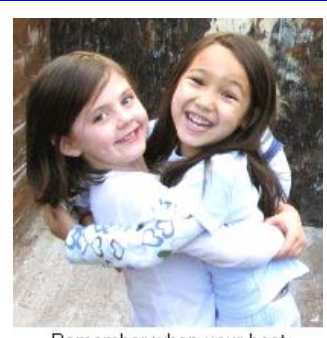
Remember when your best friend lived right next door?